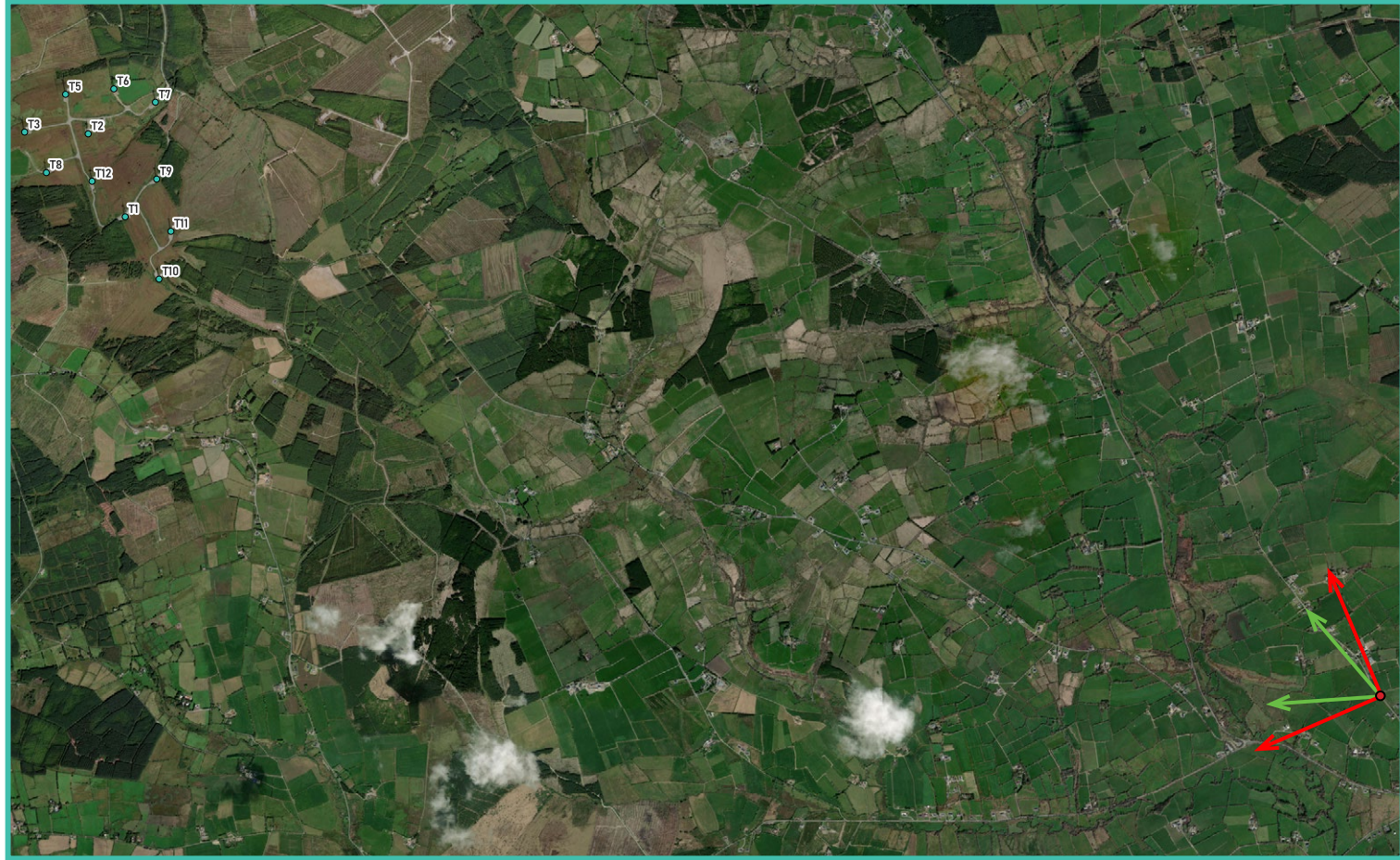
View point relative to wind farm site.