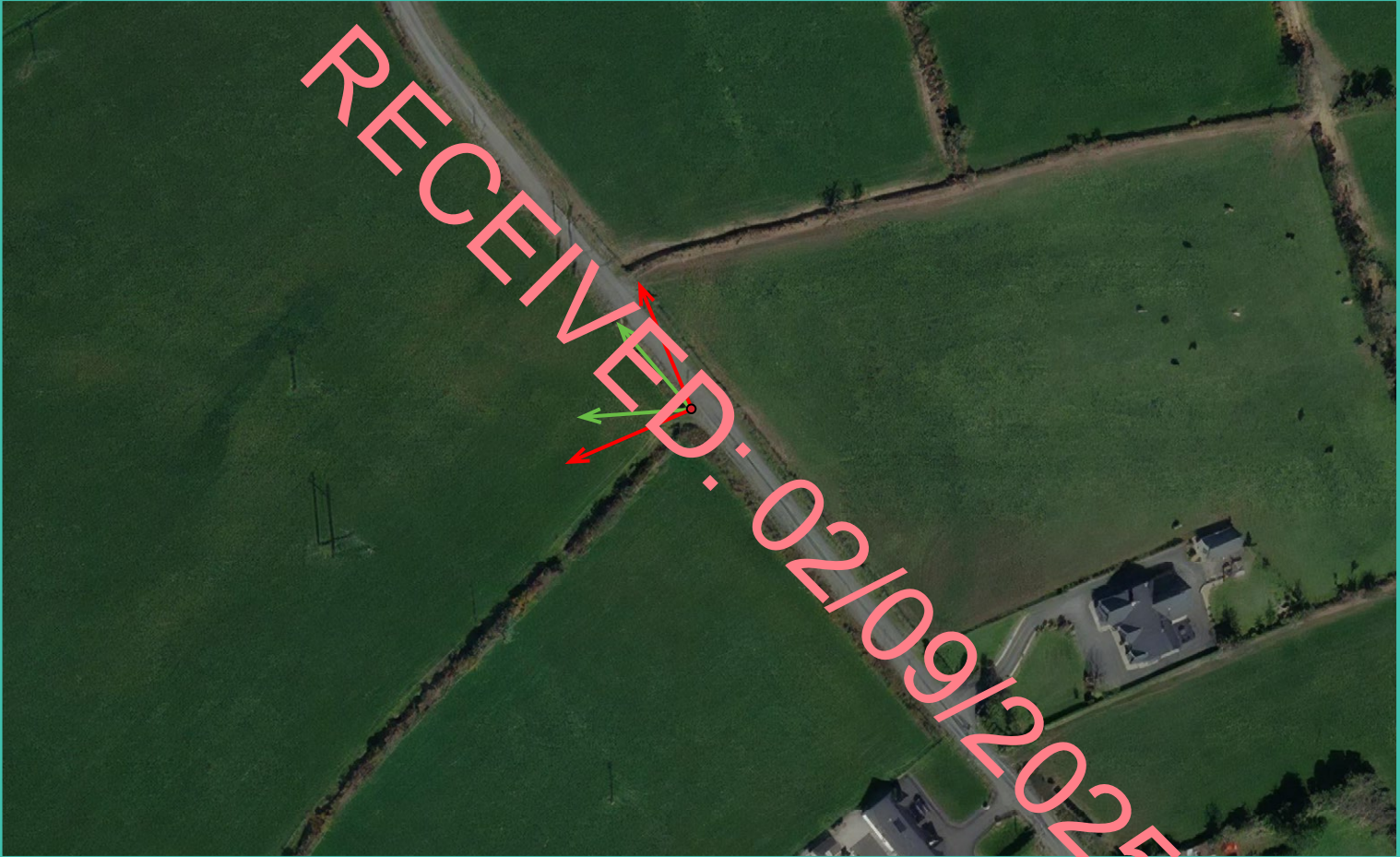
Detail of view point location.