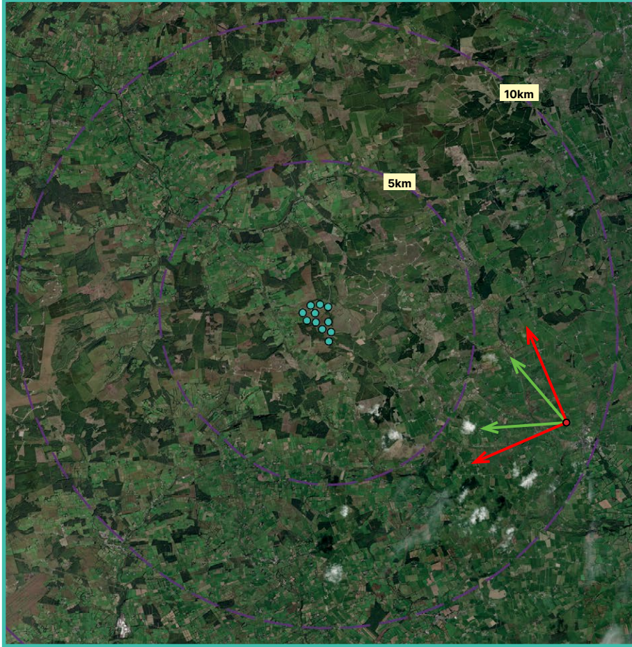
View point relative to 10km radius.